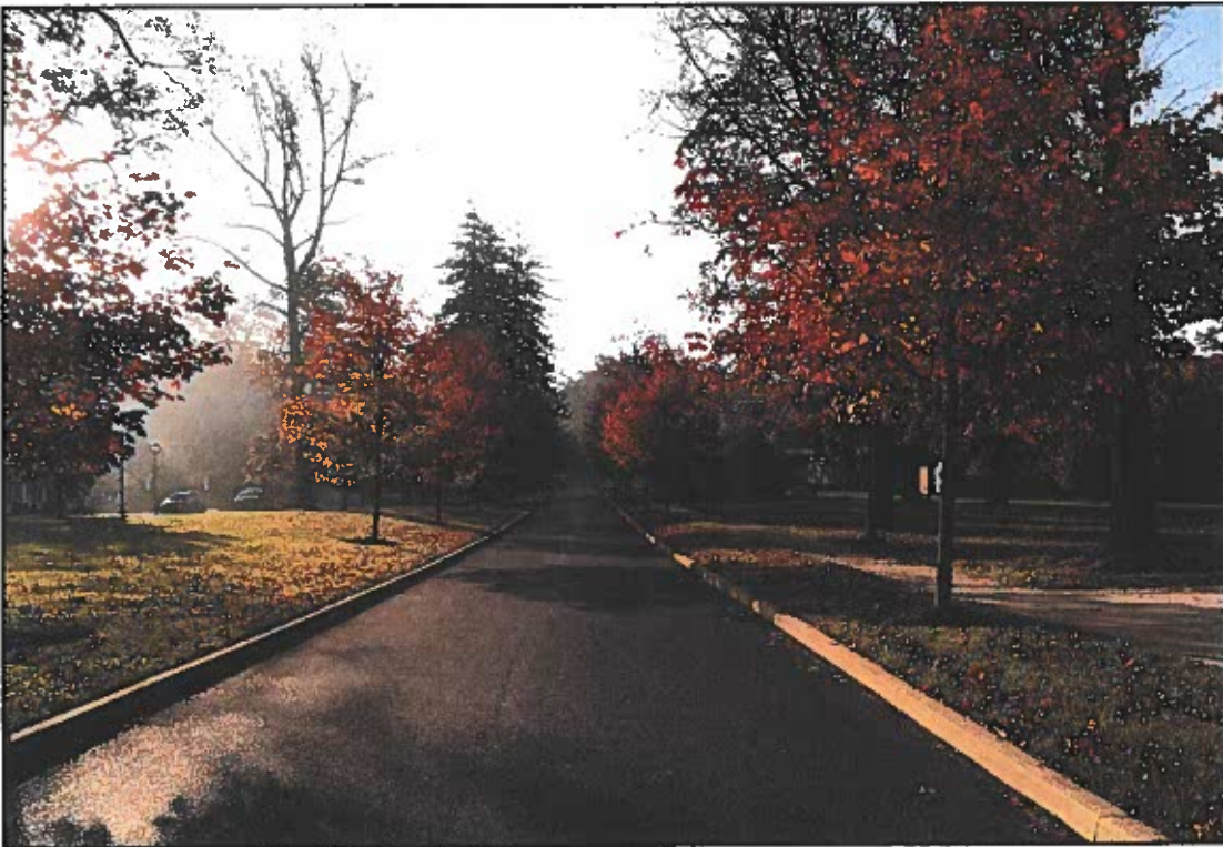
Maple Drive in Autumn, Lincoln University, PA