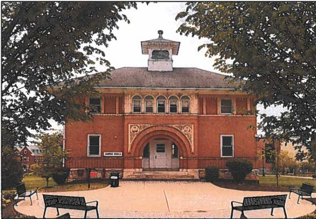
Amos Hall (1902), Lincoln University, PA