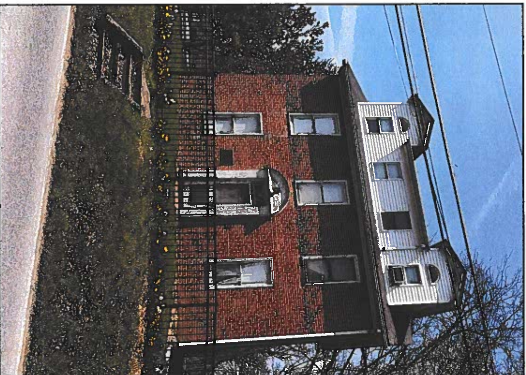
Amos House (1871), Lincoln University, PA

A Lincoln University Heritage Project • 2018