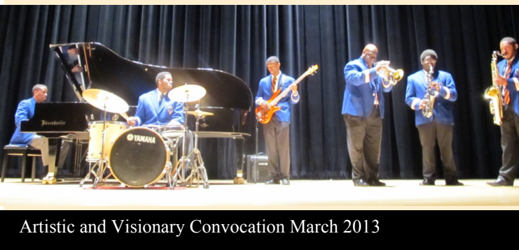
Artistic and Visionary Convocation March 2013

Mass Communications completed a draft of a revised curriculum to include two tracks: Digital Media and Strategic Communication. Foreign Languages and Literatures implemented the Chinese minor and English reviewed and implemented Pre-Law and Visual Rhetoric tracks, both in the English Liberal Arts Program. Two new graduate programs were developed: Master of Human Services Administration and Master of Science in Counseling.