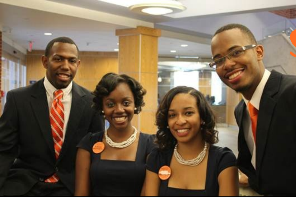
Elected student government officers advocate for student rights while enhancing the cultural, social, and physical welfare of The Lincoln University student body.

A number of new initiatives were conducted by the Division of Student Affairs . They included assisting in organizing the Parents Association , the Student Executive Council (co-sponsored with the Office of the President ), and Weekly Convocations (in cooperation with the President's Office ) and the LU Sustainability and Green Initiative .