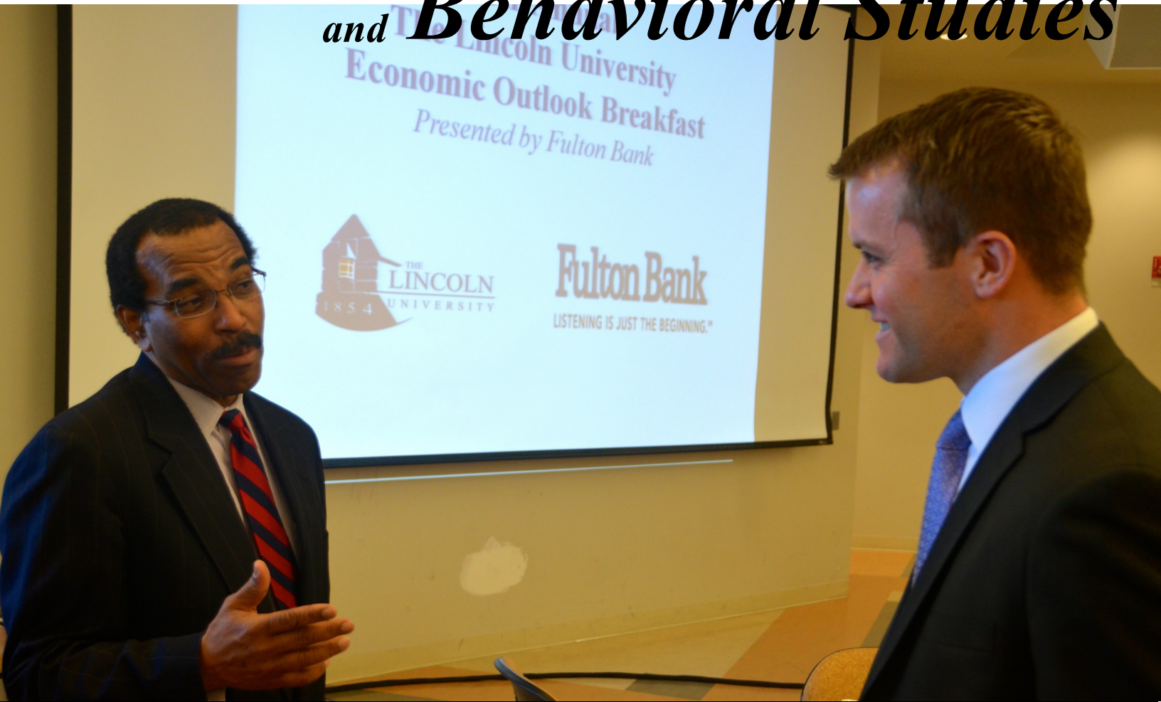
The 10th Annual Lincoln University Economic Outlook Breakfast held in April was sponsored by Fulton Bank..

The School of Social Sciences and Behavioral Studies comprised six academic departments, including: Business and Entrepreneurial Studies, Education, Health Physical Education and Recreation (HPER), History and Political Science, Psychology, and Sociology and Anthropology.