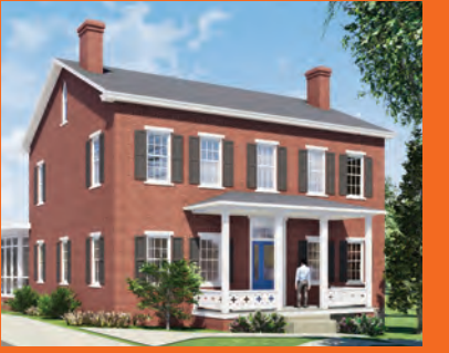
Architect's rendering of the renovated Azikiwe-Nkrumah Hall