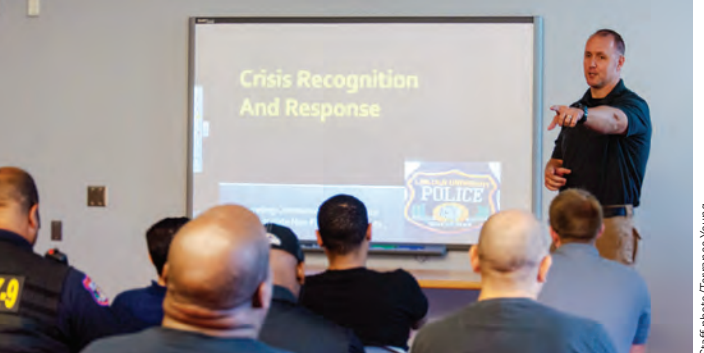
Public safety officers participate in crisis training on August 2, 2019, in the International Cultural Center.