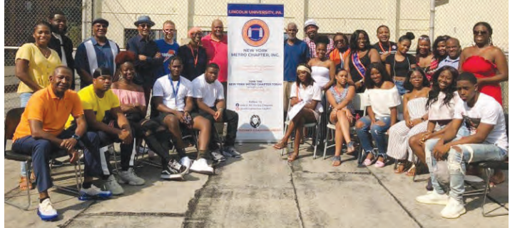
AALU New York Chapter hosts the Pre-Alumni Council, Royal Court, and new students.