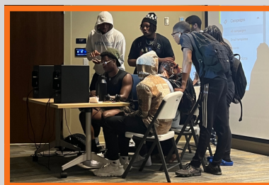
Ebononthetrack (music producer)