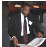
If you would like to be featured in the Spotlight on Students section, please see Mrs. MyersSmith.